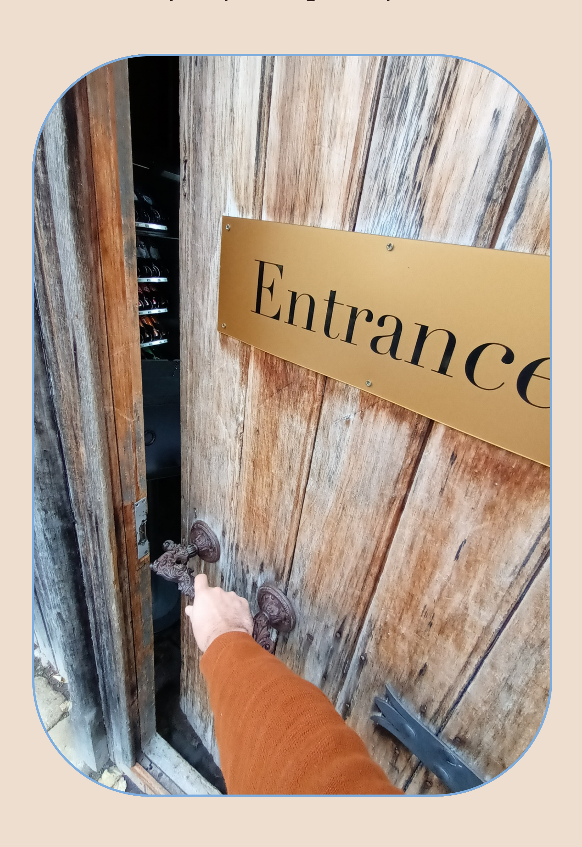
Enjoy your stay!

The door opens and you can go immediately to your right to your room.